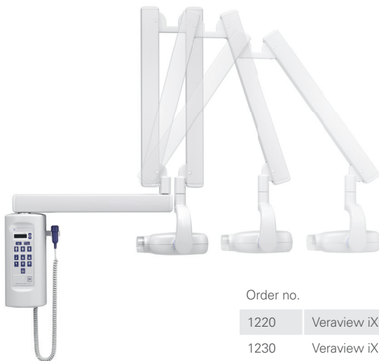
iX-WA wall-mounted version