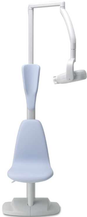
iX-R model with patient's chair